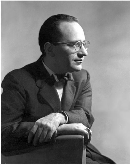
Murray N. Rothbard