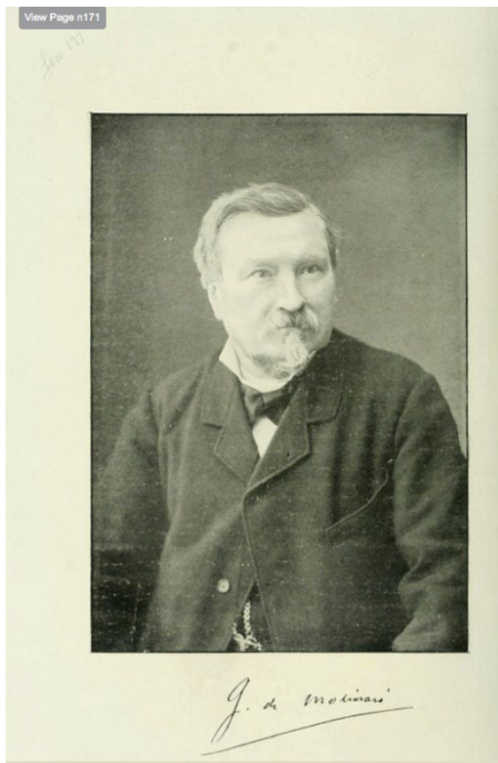
Gustave de Molinari

An intriguing counterfactual thought experiment is to ask oneself what Bastiat might have accomplished if he had lived as long as Karl Marx (1818-1883 - that is, 65 years), who was incidentally born the year before Bastiat's close friend and colleague Gustave de Molinari (1819-1912). The two writers had quite a lot in common, being accomplished journalists and economic theorists, and having a strong interest in class and the sociology of the state. Marx finished volume one of his magnum opus, Das Capital , in 1867 when he was 49, the same age as Bastiat when he died. If Bastiat had been in good health, had not been distracted by the 1848 Revolution, and had lived another 16 years like Marx (and died in 1866 not 1850), perhaps he might have finished Economic Harmonies in 1851 or 1852, with perhaps a second volume to come a couple of years later. If he had thought through his proto-Austrian insights into subjective value theory, the notion of "the exchange of service for service," and his ideas on rent, perhaps he might have precipitated the marginal revolution 20 years ahead of time, thus setting classical political economy on an entirely new trajectory at a time when it had its most influence.