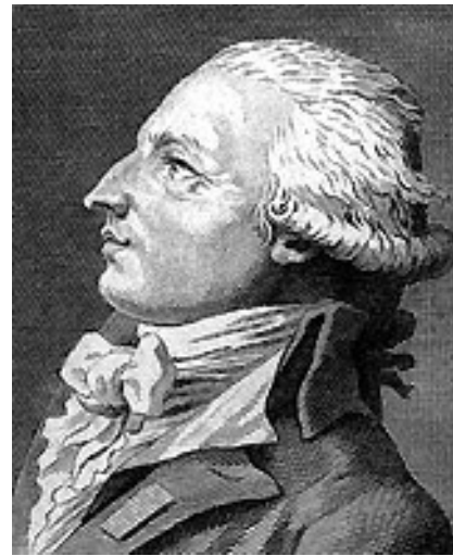
Antoine Louis Claude, Comte Destutt de Tracy

[42] Bastiat, What is Seen and What is Not Seen (1850), Chapter: 6. Middlemen < /title/956/35432 >.