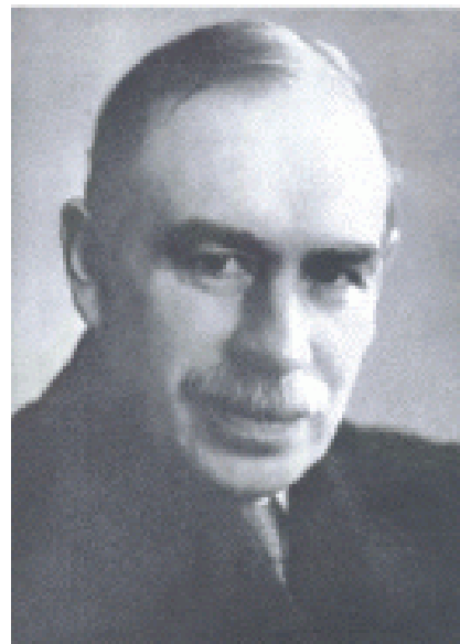
John Maynard Keynes

Even if an imaginary Fred Bastiat of 20th-century America had somehow come into this world with every predisposition possessed by the actual Bastiat, would the 20th-century version have been able to resist the peer pressure to treat economics as if it were a branch of physics? Would the hypothetical 20th-century version of Bastiat have seen as clearly as the real Bastiat the flaws of Keynesian-style free-lunch thinking? Might the 20th-century Bastiat be known to us today as history's greatest popularizer of Keynesian notions?