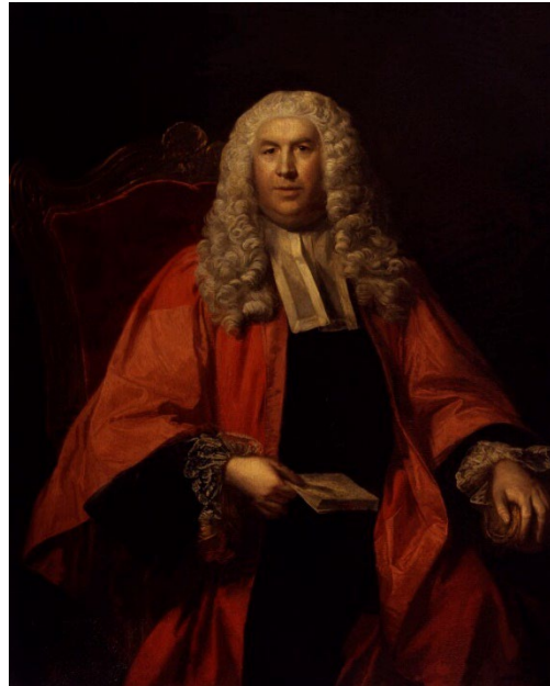
Sir William Blackstone

Grotius – like his progeny Montesquieu and Blackstone – was an intentionally moderate sort of modern, liberal mind. This strain in the moderate Enlightenment sought to retain or revive elements of classical and medieval thought that would achieve the humane aims of modernity and liberalism more adequately than had the radical philosophies that repudiated the philosophical tradition to a substantial degree. That repudiation was undertaken both in the name of human progress and in the name of analytical clarity.