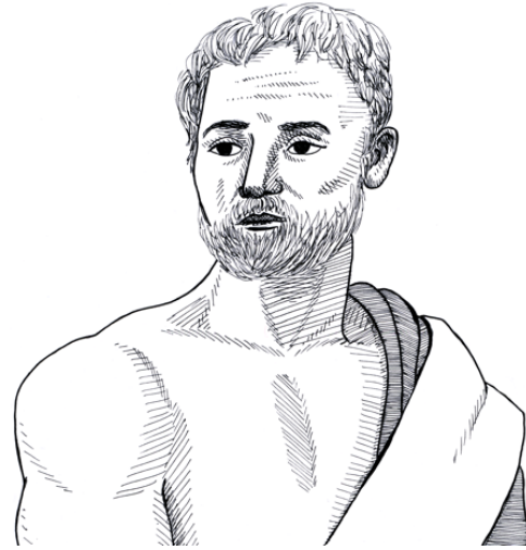
Publius Cornelius Tacitus

leading jurist and diplomat to enlighten us about the international practices of his time .