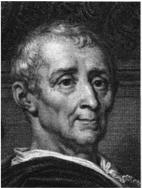
Charles Louis de Secondat, Baron de Montesquieu

promote peace and commerce, and thus to support the conditions for individual and political liberty. These jurists in turn deeply influenced the American founders in their effort, during the 1780s and 1790s, to construct a constitutional order and distinctive American grand strategy that would permit war only as part of a larger philosophy of peace, international order, protection of individual rights, and commerce. These are extraordinary achievements in human civilization, and it was this more complex or seeming paradoxical mode of philosophy that helped statesmen to promote liberty and civility.