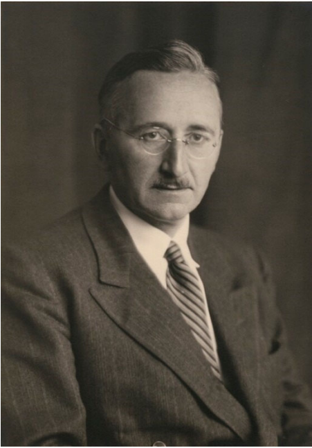
Friedrich von Hayek

Plunder and predation seem to me somewhat different. While there are unusually greedy people, unusually bloodthirsty people, and people unusually driven to dominate, plunder and predation are only sometimes closely linked to such people, and such people are not necessarily the most effective at those tasks. As David notes, really large-scale plunder and predation are never the work of one man alone--and the ability to carry them out on a large scale over a sustained period requires the ability to credibly commit to sharing the proceeds of plunder across the dominant groups. The one monstrous ruler may commit true horror for years or decades without teaching us much about what stable long-term domination and exploitation really look like. The coalitions of elites that make up governing structures are better able to carry on their plunder without genocidal sociopaths.