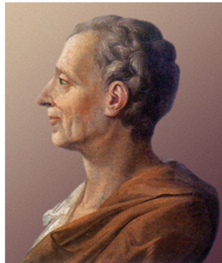
Charles Louis de Secondat, Baron de Montesquieu

much like some kind of a societal “central planner” or lawmaker who knows what is in society’s best interest; and “pluralism” as a “bottom up” process, much like Hayek’s notion of “spontaneous order,” where a multiplicity of private associations with dispersed local knowledge emerge “spontaneously” to solve social problems. The historical example that comes to my mind when thinking along these lines is the “top down” rationalist abolition of the guilds and corporations (also known as “feudalism”) which took place in France on 4 August, 1789. [16] This was accomplished by a revolutionary seizure of power by various groups (including a strong classical-liberal faction such as the Girondins) and the immediate and “top down” abolition of centuries of legal and economic practice by many private associations which made up the French “ancient constitution.” Some of these ancient bodies were guilds and corporations which might at one time have served the needs of their members and society at large but which, over time, had become ossified by rent-seeking and monopoly privileges granted by the state and had thus become hated institutions by 1789 which deserved to be abolished.