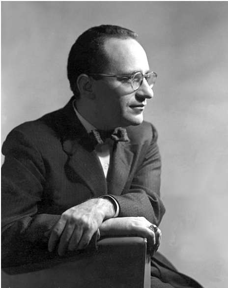
Murray N. Rothbard

The pluralism-vs.-rationalism opposition which Jacob observes within the classical-liberal tradition is one that I have found very helpful in trying to bring some sort of order to the rather obstreperous collection of intellectual groups which have all contributed their individual two cents worth (or in some cases five cents worth) to the tradition's intellectual development over the centuries. Another one of Jacob's great successes is in showing just how many centuries back one should trace these intellectual movements and groups. His interest in the Monarchomachs is an excellent example of this.