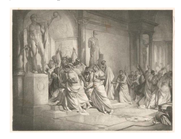
Murder of Julius Caesar

But suppose we extend our discussion to take up one play in which Shakespeare presents a celebrated instance of a quest for absolute power and a second play which depicts several characters who continually suffer diminishment of power to the point of its extinction in death. I'm referring to Shakespeare's Julius Caesar for the first subject and to King Lear for the second.