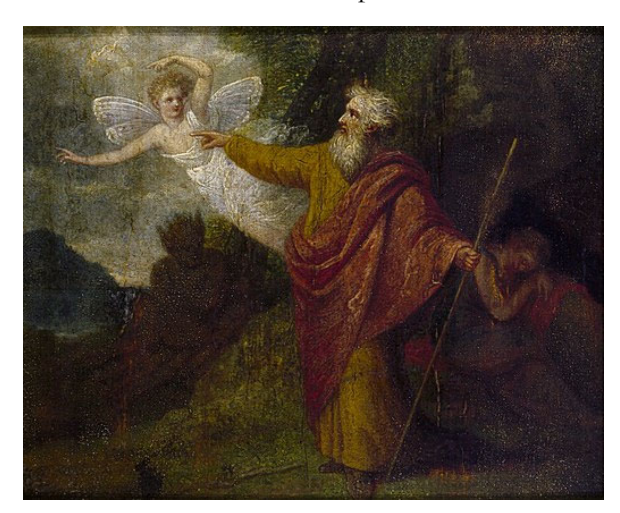
Prospero commanding Ariel

his magic, with its instrument Ariel, the penitential trials inflicted on the noblemen cast up on his island.