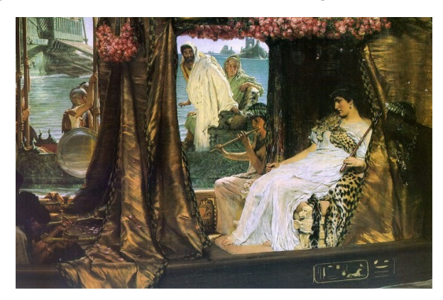
Antony and Cleopatra

upon her subjects "easy ways to die" (not confining experimentation to prisoners condemned for capital crimes as Shakespeare had read in Plutarch). Otherwise, it appears we have little indication of the character of her rule. Antony's corruption registers in his inattentiveness to military obligations. Here the cause lies in his love. His doting upon Cleopatra is lamented by his officers and becomes the cause of his losing to his rival Octavian the decisive sea battle of Actium. If the standard by which Shakespeare guides our judgment consists in the selfcommand needed for generalship as well as for effective political rule, then both rulers suffer corruption. Yet judgment awaits a clarification inasmuch as the erotic preoccupations of the lovers seem not more afflicting to the people they rule than the partisan political scheming of the grand Roman power brokers. With the demise of the republic vanishes any sense of a common good to be served by political virtue. As Shakespeare presents it, political life has become altogether personal. Thus between Egypt and Rome there's not much to choose. In fact the most sodden moments are those spent by the triumvirs in their attempt at Bacchic carousing aboard Pompey's galley. So personal have become political as well as military allegiances that the question must arise: is not the personal loyalty between lovers to be considered on a par with the no less personal bonds connecting generals to their subordinates and colleagues?