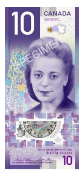
Canadian $10 bill with Viola Desmond

Supreme Court. This fight, which she ultimately lost, led to her leaving Nova Scotia for Montréal and eventually New York City, where she died in 1965.