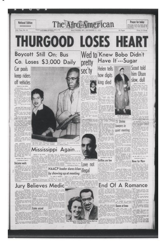
The Afro-American, No. 20, December 17, 1955

Why? First, Smith's defense of commercial society allows for a thoughtful discussion of the ways in which the free market both helps and hinders progress towards true equality. Since he argues that slavery does not make economic sense, readers can explore the idea that freeing slaves was a win-win scenario in everyone's self-interest, and the reasons why so many were unable to see so.