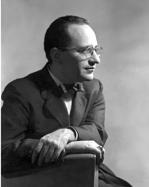
Murray N. Rothbard