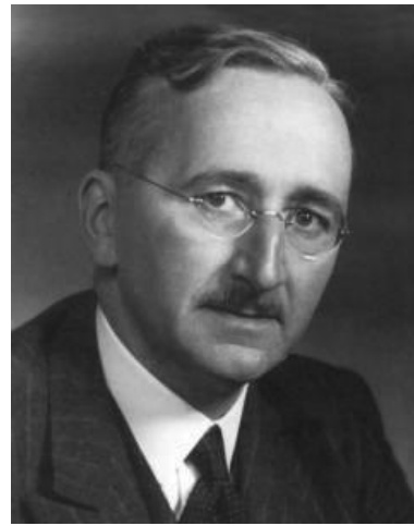
Friedrich August von Hayek

Those conservatives who would argue against Meyer’s formulation have a particularly heavy burden to carry, as they must maintain both that coercing virtue is desirable and that government—and the federal government in particular—is capable of providing inducements for virtuous conduct that will actually succeed. So even if one rejects Meyer’s individualist conception of what makes for virtuous action, one must still articulate why the federal government is going to be more proficient at directing the production of virtue than it is at directing the production of mundane goods and services.