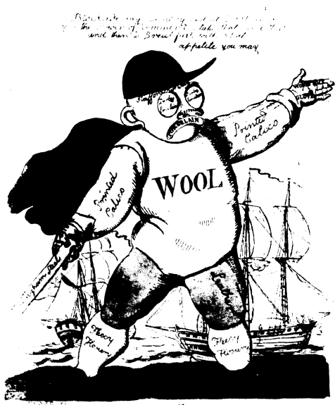
The GIANT COMMERCE

"The Saint-Simonians in Industry and Economic Development." American Journal of Economics and Sociology 38(January 1979):83-96.