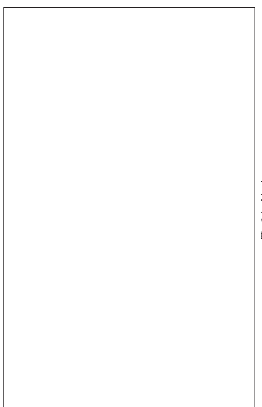
The Spice Islands