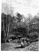
Concord Woods in May