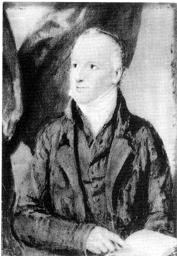
David Ricardo 1820 from the miniature by Thomas Heaphy