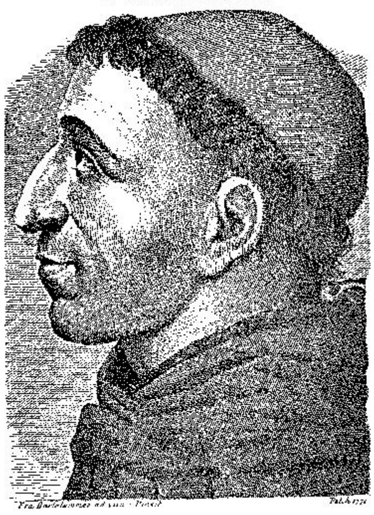
FRA GIROLAMO SAVONAROLA.