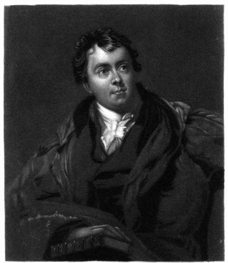
FANTED BY SIR THO! LAWRENCE