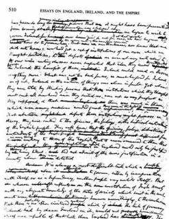
Folio 3r of draft of England and Ireland MS Houghton Library, Harvard University

epoch we had begun to know how to govern her for herself, the two nations would by this time have been one. But we neither knew, nor knew that we did not know. We had got a set of institutions of our own, which we thought suited us—whose imperfections we were, at any rate, used to: we, or our ruling classes, thought, that there could be no boon to any country equal to that of imparting a these a institutions to her, and as none of their benefits were any longer withheld from Ireland. Ireland, it seemed, could have nothing more to desire. What was not too bad for us, must be good enough for Ireland, or if not. Ireland or the nature of things was alone in fault. αβ