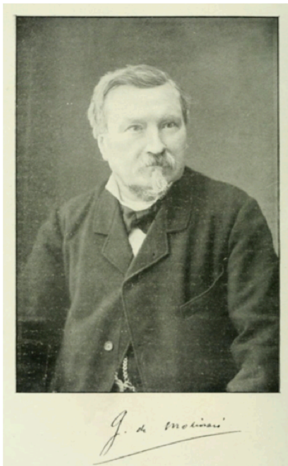
Gustave de Molinari (1819–1912)

"GUSTAVE DE MOLINARI'S LEGACY FOR LIBERTY" (May, 2013)