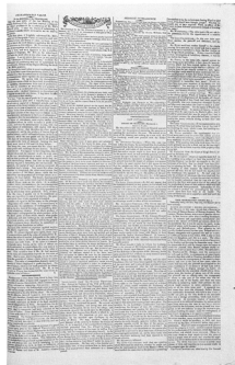
Exchangeable Value 11 Traveller, 6 December, 1822, p. 3 The British Library Newspaper Library

Our final acknowledgment is of our mutual debt; this, like most of our other writings, is, as someone has said, "a joint production, very little of which is mine."