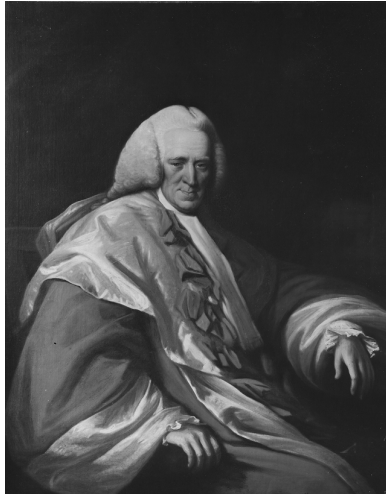
Henry Home, Lord Kames