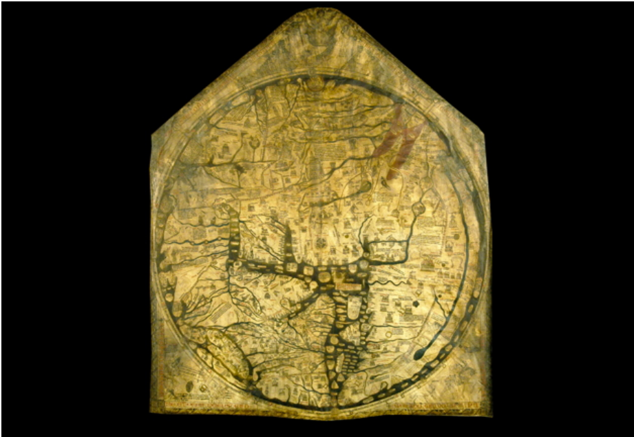
[A photograph of the Mappa Mundi (Map of the World) held by Hereford Cathedral.]