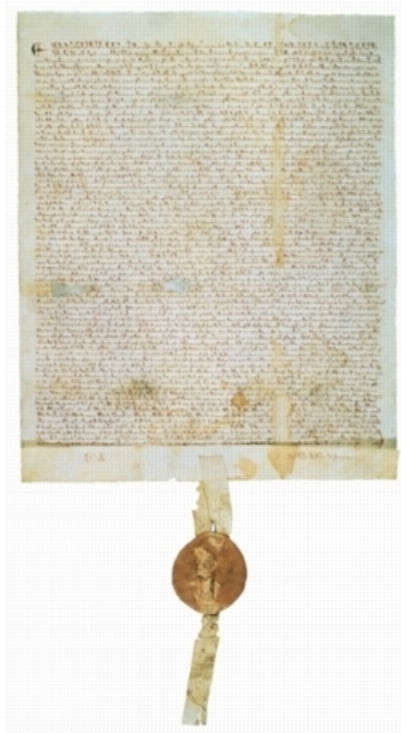
Magna Carta (1215)

Ebooks: < http://oll.libertyfund.org/titles/2706 >.