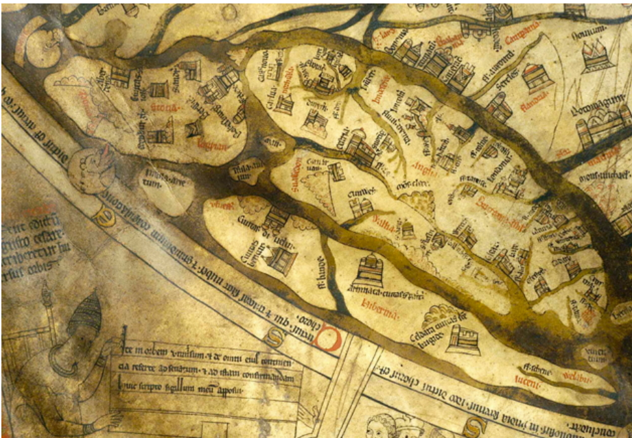
[A detail showing the British Isles from the Mappa Mundi (Map of the World) held by Hereford Cathedral.]