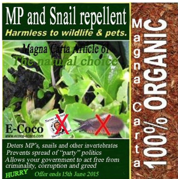
[An amusing anti-MP and party-politics illustration with a reference to Clause 61 of Magna Carta.]