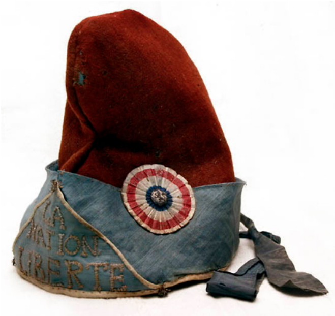
[A French Revolutionary era Liberty Cap or Pileus.]

One of the dominant modes, since at least the 1600s, has been to interpret the meaning and significance of the Magna Carta as underpinning an idea of the ancient constitution. Often this political invention of tradition has acted as a device for legitimizing an authoritative but ultimately limited form of monarchy. Most monarchies, and sovereigns, have assumed that the moment of the Magna Carta was a powerful symbol of their consensual ambitions, rather than a source of their legitimacy. The history established not the origins of regal power, but its willingness to adapt to a good office.