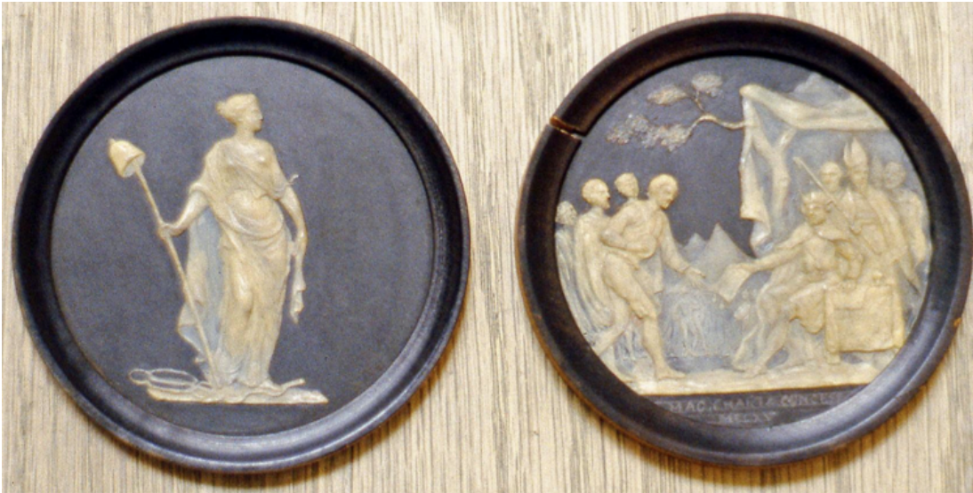
[Figure 1: The Royal Society of Arts commemorative medal.]