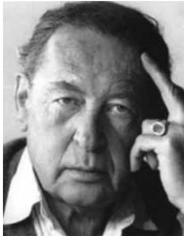
Anthony de Jasay (1925-)

Ebooks: < http://oll.libertyfund.org/titles/2708 >.