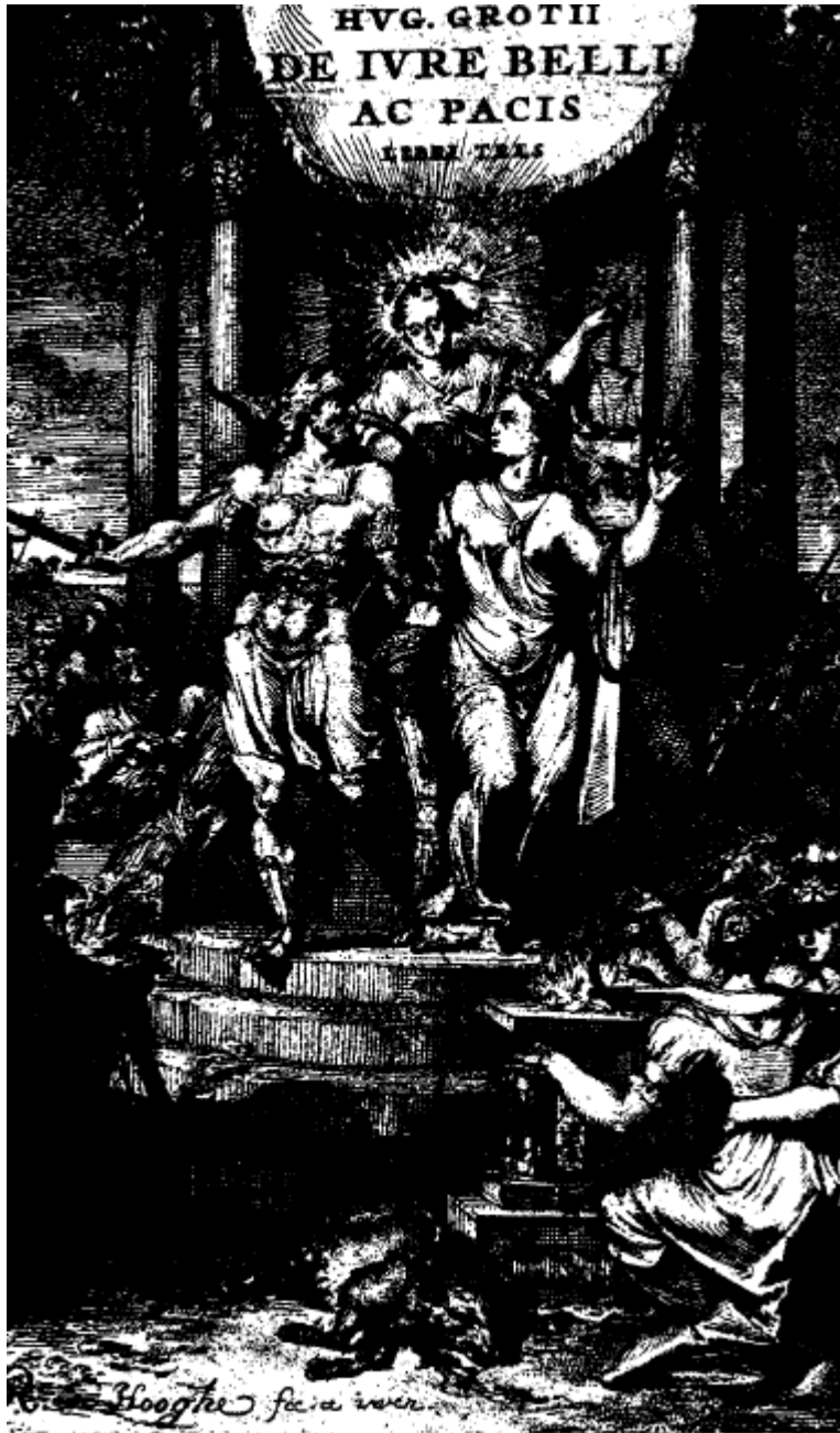
War and Peace. Frontispiece to a rare edition of Grotius.