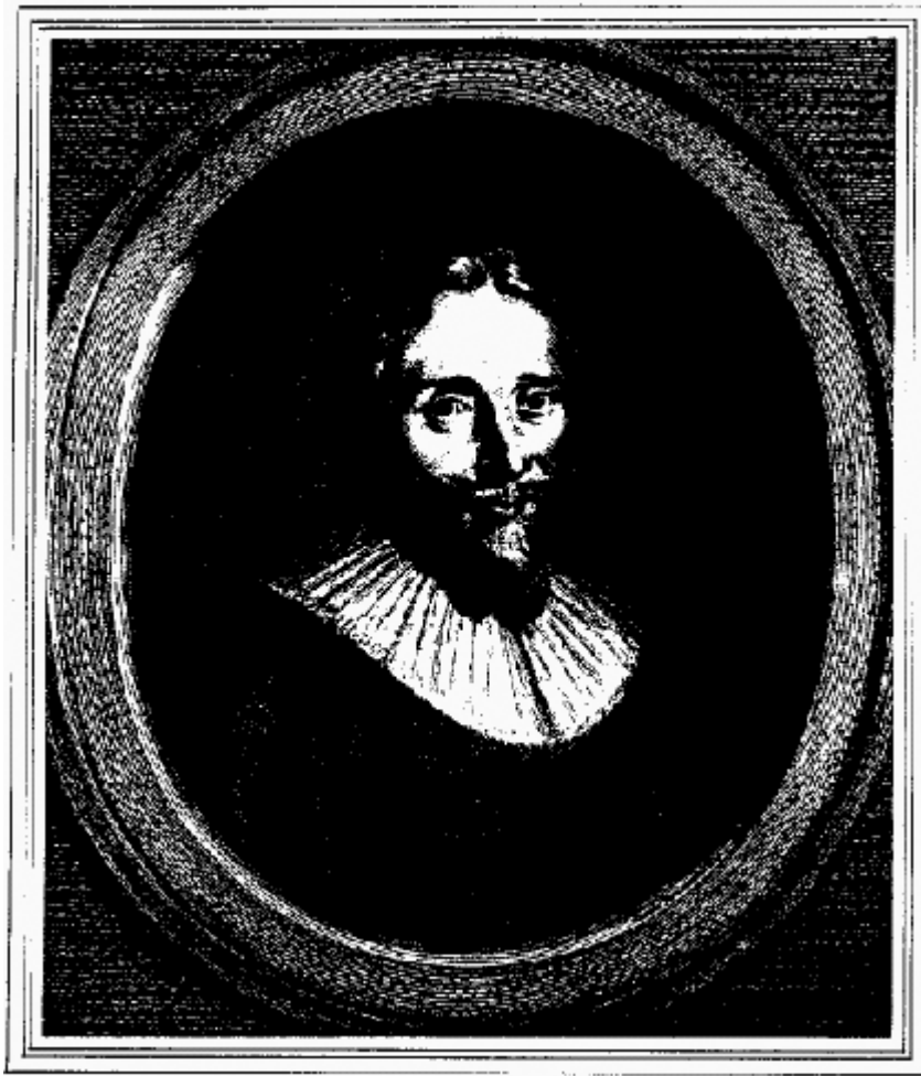
Hugo Grotius. From an original painting.