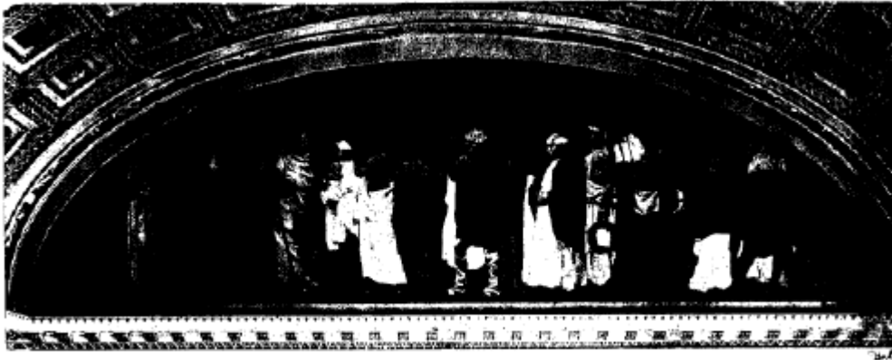
Peace. By Gari Melchers, from a panel painting in Library of Congress.

XI. The importance of such exemptions may be easily inferred from the innumerable instances, in which both sacred and profane history abound, of wars undertaken on account of the ill-treatment of ambassadors. The war which David made against the Ammonites, on that account, affords us a memorable instance from holy writ; and as a profane writer, Cicero may be cited, who deemed it the most justifiable ground of the Mithridatic war.