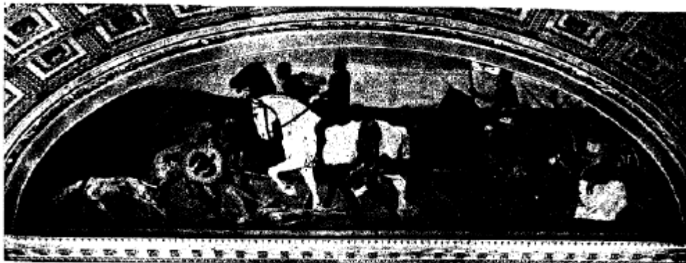
War. By Gari Melchers, from a panel painting in Library of Congress.

And this property again may be divided into smaller grants, and those again subdivided into other portions, to be held as dependent upon the original grantor, the Sovereign, or the Lord. Though the land may not be held by base service, or vassalage, yet it is possessed by some conditional tenure. For things are occupied by many kinds of right; among which may be reckoned the right of a person who expects property to be left to him under the condition of a trust. Seneca says, that an owner's being debarred from selling his lands, committing waste upon them, or even making improvements, is not to be taken as a proof that the property is not his. For that is a man's own, which he holds under any certain conditions. Since then property distributed in the manner above named is held of the sovereign, or of some intermediate Lord, who himself is tenant of the sovereign, it follows that any thing which wants an owner does not become the property of him, who can first seize it, but reverts to the state or to the sovereign.