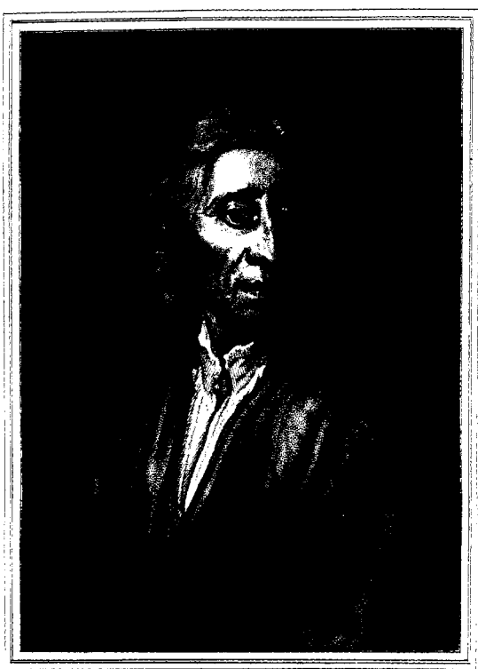
Sir G.Knaller, pinsit