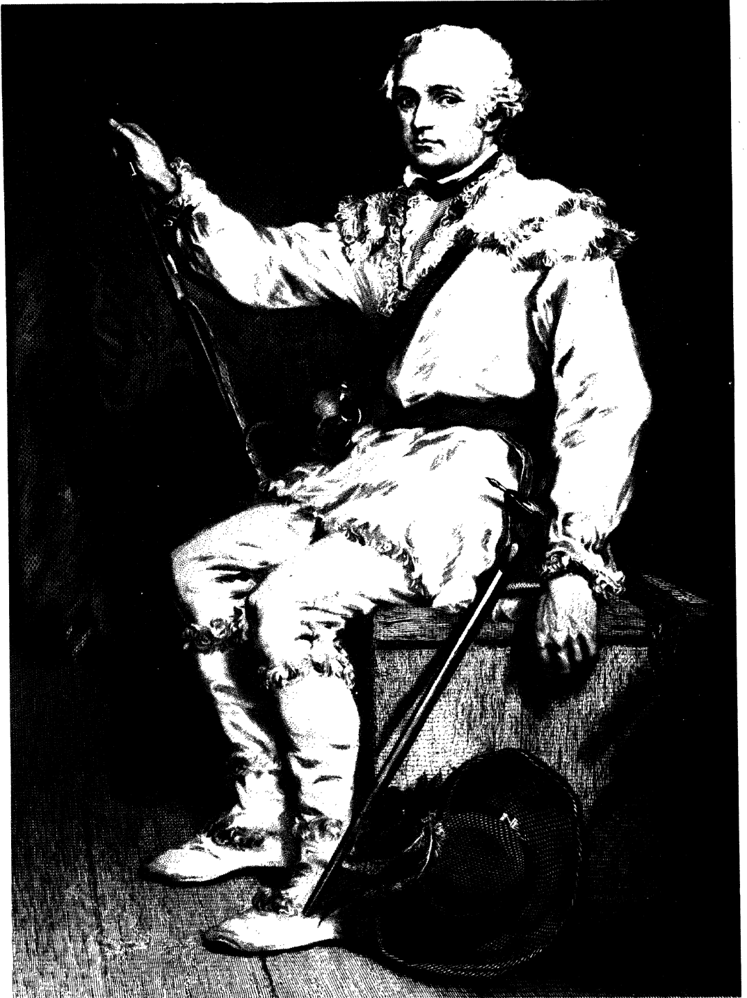
Daniel Morgan (1736–1802)